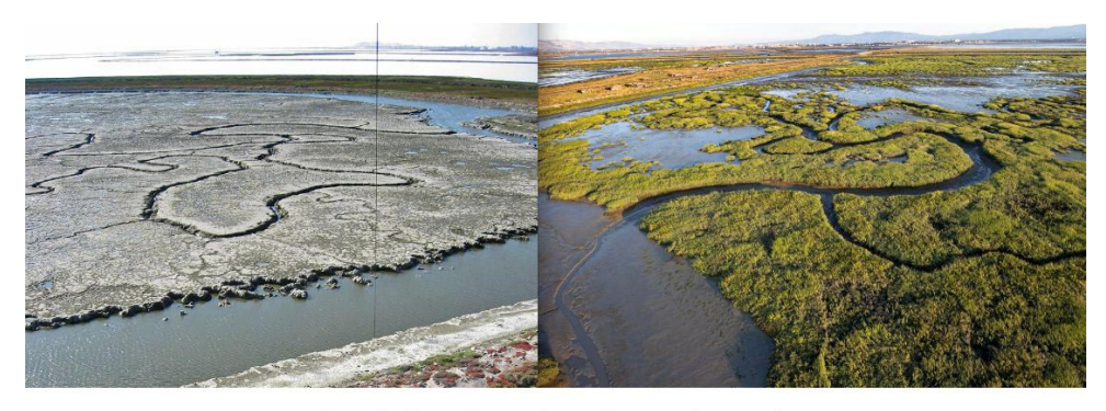
South San Francisco Bay salt ponds on the left 2006 before restoration, on the right 2014 after restoration

This is a very serious effort in which we are involved. And yet, as part of our efforts, we have many rewarding and fun times