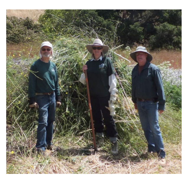
Volunteers at the Todd Quick site, in front of several weed piles that will be composted on site

The Todd Quick site (started in 2014) has several issues that make it more difficult. It is one half mile from the nearest road, which means that tools and plants need to be brought up by foot. The site is infested with poison hemlock and black mustard, the stems of which are up to 1" in diameter. While we have planted a number of trees there, we have not yet installed plant cages there as carrying in the posts and cage material will be quite a bit of work.