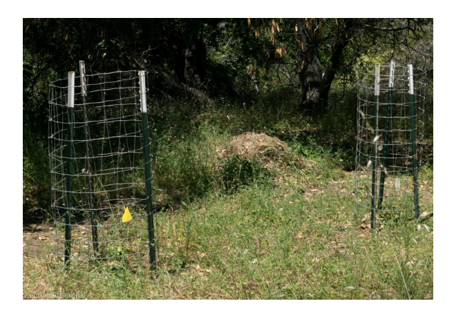
Plant cages installed to protect buckeye and hollyleaf cherry at the fire meadow

In 2014 Central Coast Wilds nursery donated 60 trees to our project, and 56 of those trees have been planted at the two restoration sites as well as a new site at the top of the Todd Quick Trail. To protect the trees from browsing by deer, we have installed a number of plant cages. We have propagated several hundred other natives from seed gathered at the park, including various grasses, flowers and shrubs.