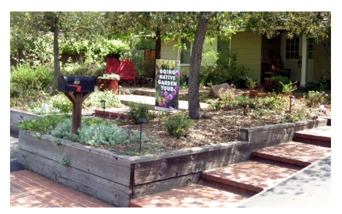
Thanks to all our wonderful volunteers, customers and visitors, our spring plant sale, wildflower show and Going Native Garden Tour were very successful!