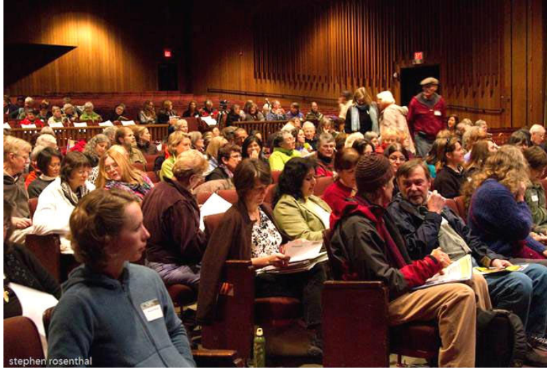
Participants at the February 2011 California Gardens Symposium fill Foothill College's Smithwick Theater