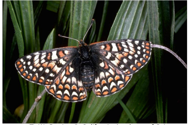
Bay Checkerspot - Euphydryas editha bayensis butterfly being re-introduced at Edgewood Park

For the past two years, Friends of Edgewood and other organizations have been practicing some grassland management techniques on Edgewood's serpentine grasslands to reduce non-native grasses. We're hoping to see an increase in native forbs at the expense of the nonnative grasses. We've had such good results in the Bay Checkerspot habitat adjacent to Interstate 280 that a fiveyear program to re-introduce the Bay Checkerspot has begun.