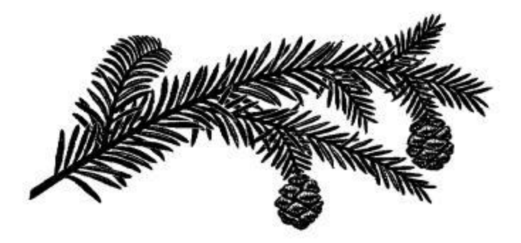
Sequoia sempervirens (coast redwood)