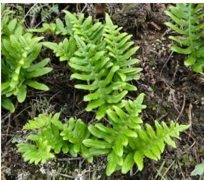
Neal Kramer (2013 Calflora) California polypody, Polypodium californicum fronds fully unfurled