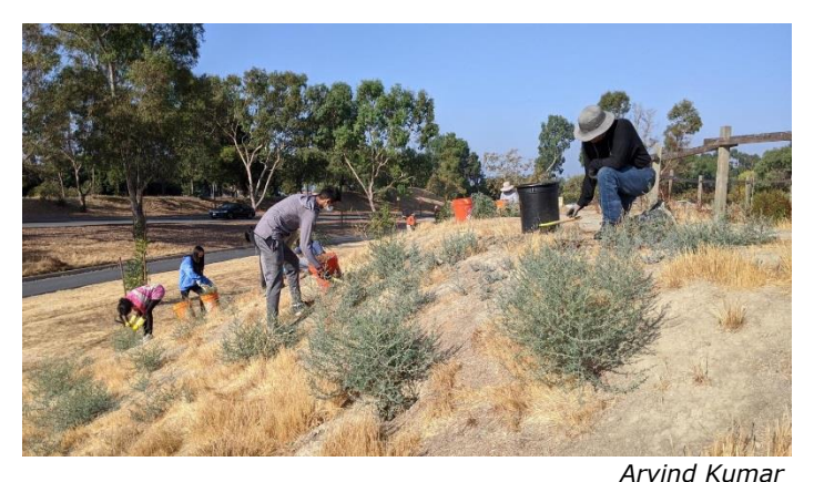
Lake Cunningham September 4 workday weeding

All volunteers must wear masks at all times and social distance, except within families/households. For more information contact Stephen Rosenthal at sailinsteve@sbcglobal.net or (650) 260-3450.