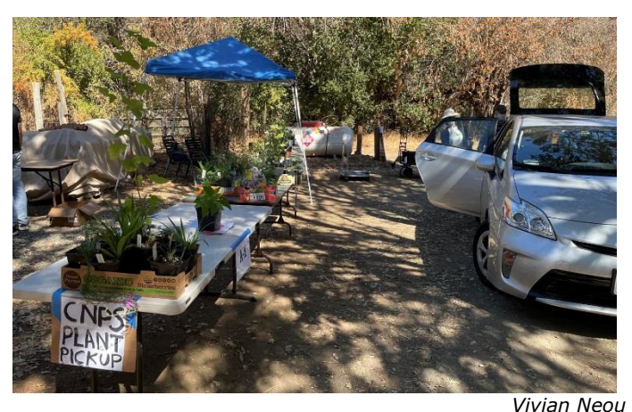
Plant sale order pickup, October 9

However, rather than a drive-through pickup, customers were able to park and stroll through the outdoor space behind the Dana Center where they could participate in a seed exchange and shop at Coyote Brush Studios, Wild Jules Seed Balls and our Chapter's book and t-shirt booth. Masks and ample outdoor space kept everyone safe and healthy while shopping.