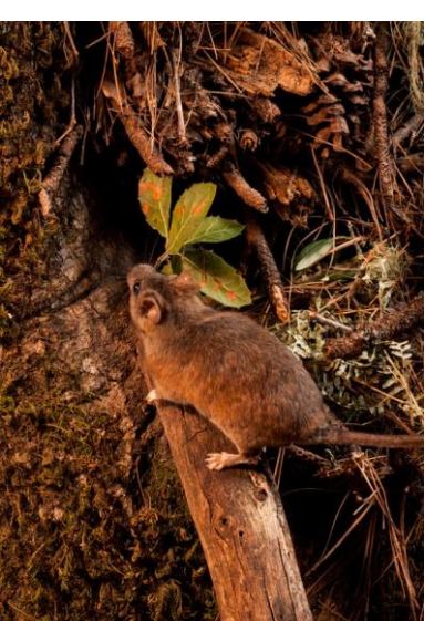
A big-eared woodrat carrying a sprig of live oak leaves, her favorite food, into her house

Most of our lectures take place on Wednesday evening at 7:30pm and are livestreamed simultaneously to Zoom and YouTube. View them on our YouTube channel at