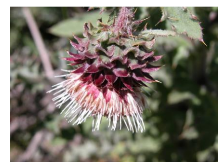
Toni Corelli Federally endangered fountain thistle in bloom May 2007, San Francisco Peninsula Watershed

Fountain thistle ( Cirsium fontinale var. fontinale ) is a rare endangered plant that grows in an unusual specialized habitat, serpentine seeps. It is found only in a few places on the San Francisco Peninsula and only in San Mateo County.