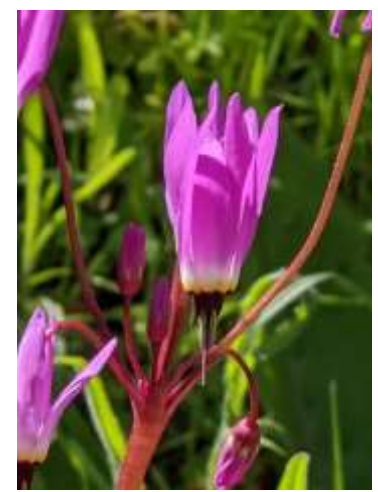
Joerg Lohse Shooting star Primula hendersonii at Rancho Cañada del Oro Open Space Preserve, March 2020.