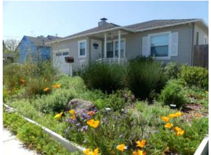
California native poppies, blue-eyed grass, rush and fescue take center stage in a sea of native foliage in front of a private home

Christopher Telomen ( they/any ) is a white, queer, trans/NB, chronically ill, and ADHD California native habitat care worker. They design, install and maintain native gardens around the so-called San Francisco Bay Area on stolen indigenous land. Their work is necessarily intersectional, incorporating frameworks of pollinator relationships, sustainable material sourcing, invasive plant management, white supremacy, disability, settler-colonialism, land back, climate change, immigration and poverty. They center indigenous people, plants, and animals in their work and they provide sliding scale services for people who need them.