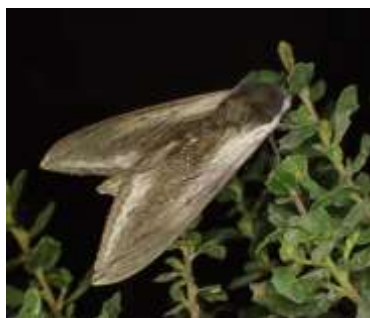
Vivian Neou Elegant sphinx moth on scrub oak, July 2021

Sat Jul 26 8:30pm - 11:55pm Moth Night at Monte Bello Preserve