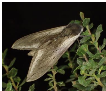
Vivian Neou Elegant sphinx moth on scrub oak, July 2021

Sat Jul 26 8:30pm - 11:55pm Moth Night at Monte Bello Preserve