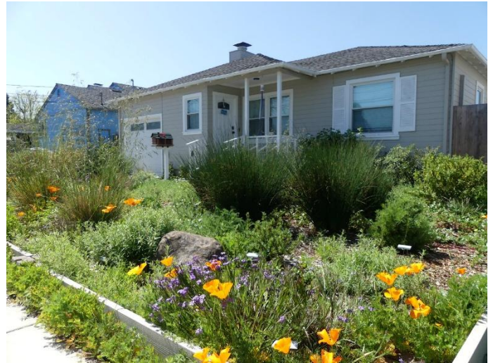
California native poppies, blue-eyed grass, rush and fescue take center stage in a sea of native foliage in front of a private home

Christopher Telomen ( they/any ) is a white, queer, trans/NB, chronically ill, and ADHD California native habitat care worker. They design, install and maintain native gardens around the so-called San Francisco Bay Area on stolen indigenous land. Their work is necessarily intersectional, incorporating frameworks of pollinator relationships, sustainable material sourcing, invasive plant management, white supremacy, disability, settler-colonialism, land back, climate change, immigration and poverty. They center indigenous people, plants, and animals in their work and they provide sliding scale services for people who need them.