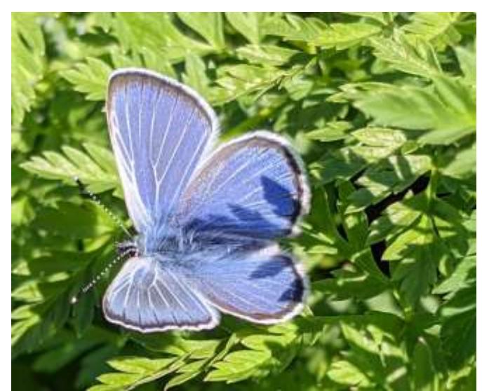
Silvery blue butterfly ( Glaucopsyche lygdamus ) photographed in Alum Rock Park March 2021. This image reminds your editor of the now extinct Xerces blue butterfly. The conservation group known as the Xerces Society is named after the Xerces blue.