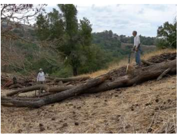
Volunteers sawing up a recently fallen pine tree and rolling away the pieces, to make room to weed and plant. October 2021

Sound interesting? Steve invites new volunteers to join the project. Our workdays take place every Monday and Wednesday, from 8:30am to about noon . Sometimes we have special extra workdays.