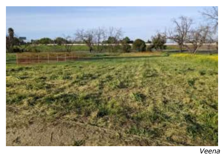
Portion of the park to be landscaped, before mulching

The goals of the Cataldi Park native garden project are to create a habitat for native plants and pollinators including monarch butterflies, and to spread awareness about native plant habitats and pollinators among volunteers and visitors.