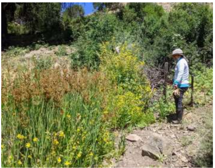
A seep provides water that supports these seep spring monkeyflowers and rushes. May 2021

Also downslope from the seep, there was a large pine tree that had fallen. The crew cut the tree into smaller pieces, to restore access to this area so they can remove weeds and plant new plants. Water runs down from the seep into the saddle at the left of the photo (above), which makes for a moist environment that supports a variety of plants.