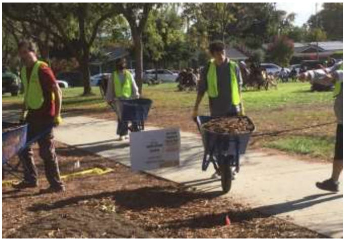
Volunteers transported mulch in wheelbarrows, from a GIANT pile of mulch delivered 250 feet away, to the garden, during the October 2022 mulch workday

Last year we got a grant through Happy Hollow Foundation, community donations and a corporate matching grant. (See happyhollow.org/explore/ conservation/progress-for-pollinators/.