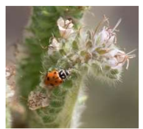
Ladybug on California phacelia in new Kirk Park Native Pollinator Garden

People I didn't know would stop and talk. Pretty soon I had people offering to help out.