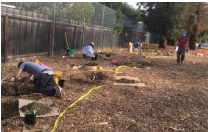
Volunteers planting in the garden, during one of the community planting days held in October 2022

other pollinators. These kits are available for projects on public lands and other specified areas. (See xerces.org/pollinator-conservation/habitat-kits/california.)