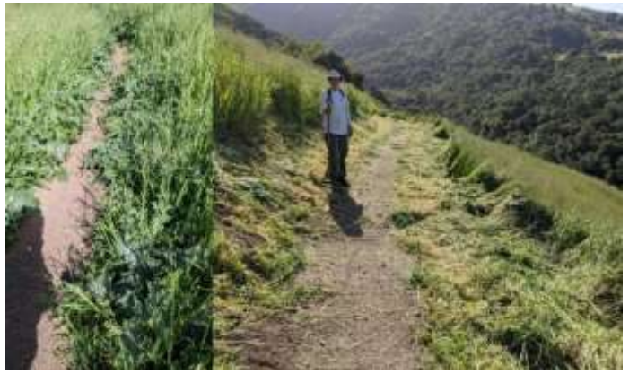
Left: overgrown trail. Right: trail cleared by volunteer via weed whacker. April 2023