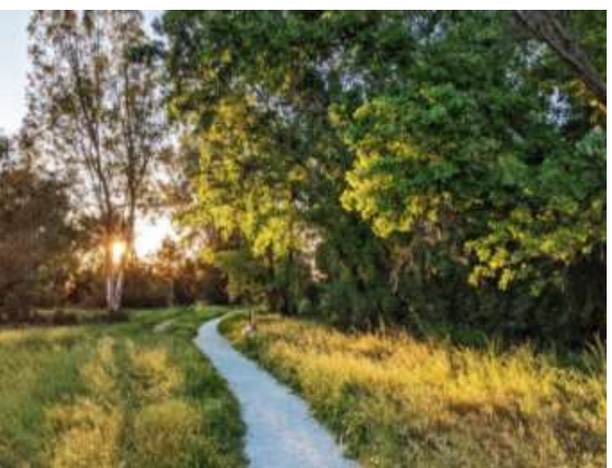
Ulistac Natural Area Ulistac Natural Area in Santa Clara

The Ulistac Natural Area Restoration and Education Project (UNA), a 501(c)(3) non-profit organization, seeks a CNPS member to join their board.