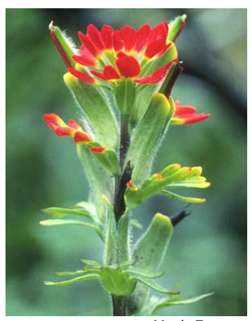
Mark Egger Castilleja zempoaltepetlensis

many species in the genus that are rare and declining due to a variety of causes, as well as many others that are extremely range-limited due to their stringent habitat requirements. Many of these species are seriously threatened with extinction from a variety of mostly human-caused factors, including global warming and resultant climate changes.