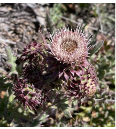
Dee Himes Fountain thistle in bloom at the Caltrans restoration site.

On Saturday June 5 we conducted another successful spring habitat restoration project for the federally endangered fountain thistle (Cirsium fontinale var. fontinale) on Caltrans land near the junction of Hwy. 92 and I-280. This is a continuation of the combined Yerba Buena Chapter-Santa Clara Valley Chapter effort led by Jake Sigg for over 10