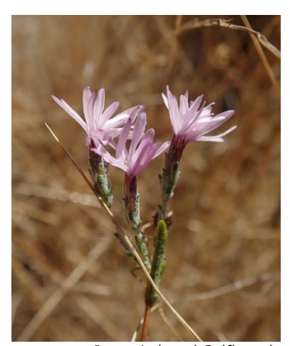
Crystal springs lessingia, observed at Caltrans fountain thistle restoration site October 2019. California Rare Plant Rank 1B.2

more widely through the Bay Area along transportation corridors. Fennel (Foeniculum vulgare) is another invasive plant of concern that requires ongoing control.