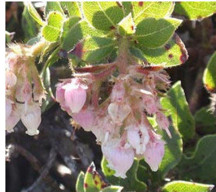
Toni Corelli Endangered San Bruno Mountain Manzanita ( Arctostaphylos imbricata )

Habitat restoration has been a way of life on San Bruno Mountain since the 1982 inception of a Habitat Conservation Plan for three endangered butterflies. The Saddle area, which encompasses the northernmost several hundred acres of the Mountain's parkland, is home to