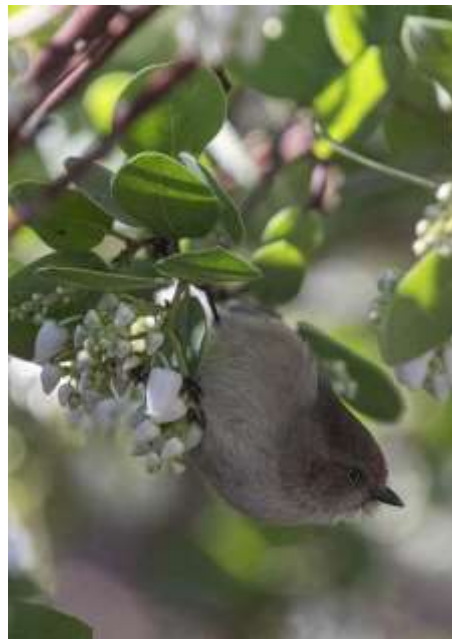
A bushtit ( Psaltriparus minimus) hunts for insects and spiders in a Dr. Hurd manzanita